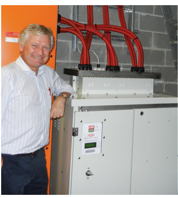
Wilson's 750 kVA Voltage Power Optimiser installed in Melbourne

Coupled with a delta connected tertiary winding the Wilson's Voltage Power Optimiser improves power quality by minimising harmonics with a slightly improved power factor.